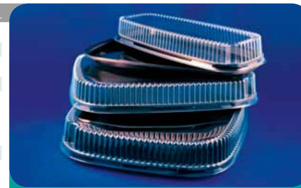
RS 310 / RS 390